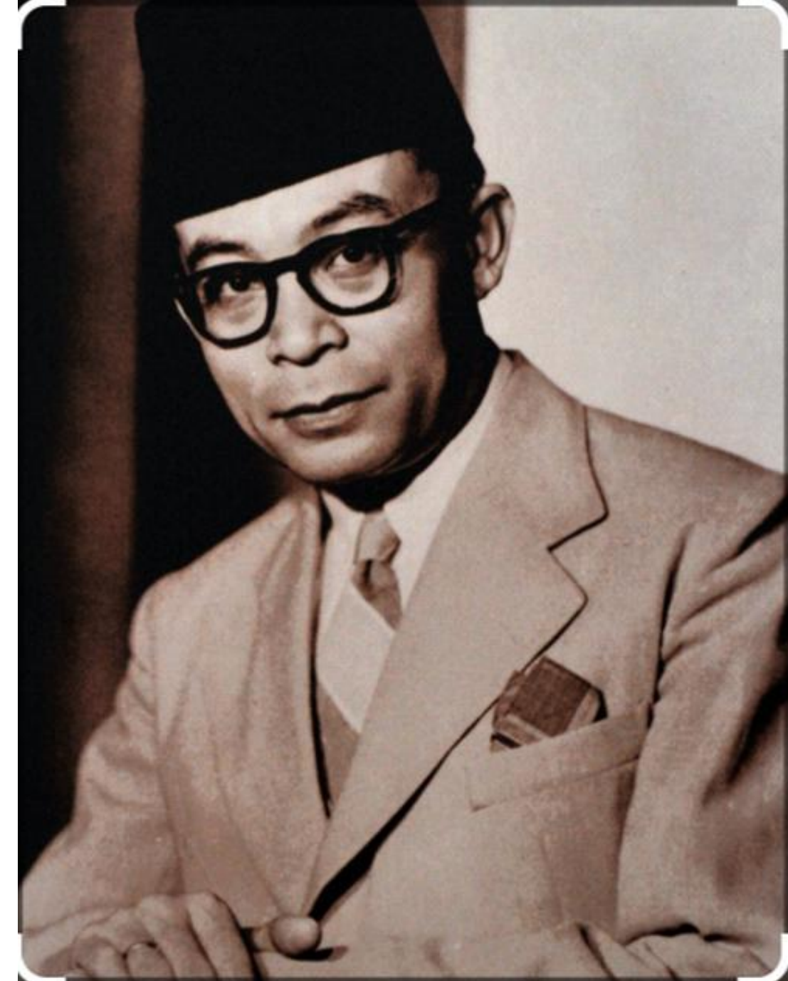
DR Mohammad Hatta – 1st Vice President Indonesia co-founding father